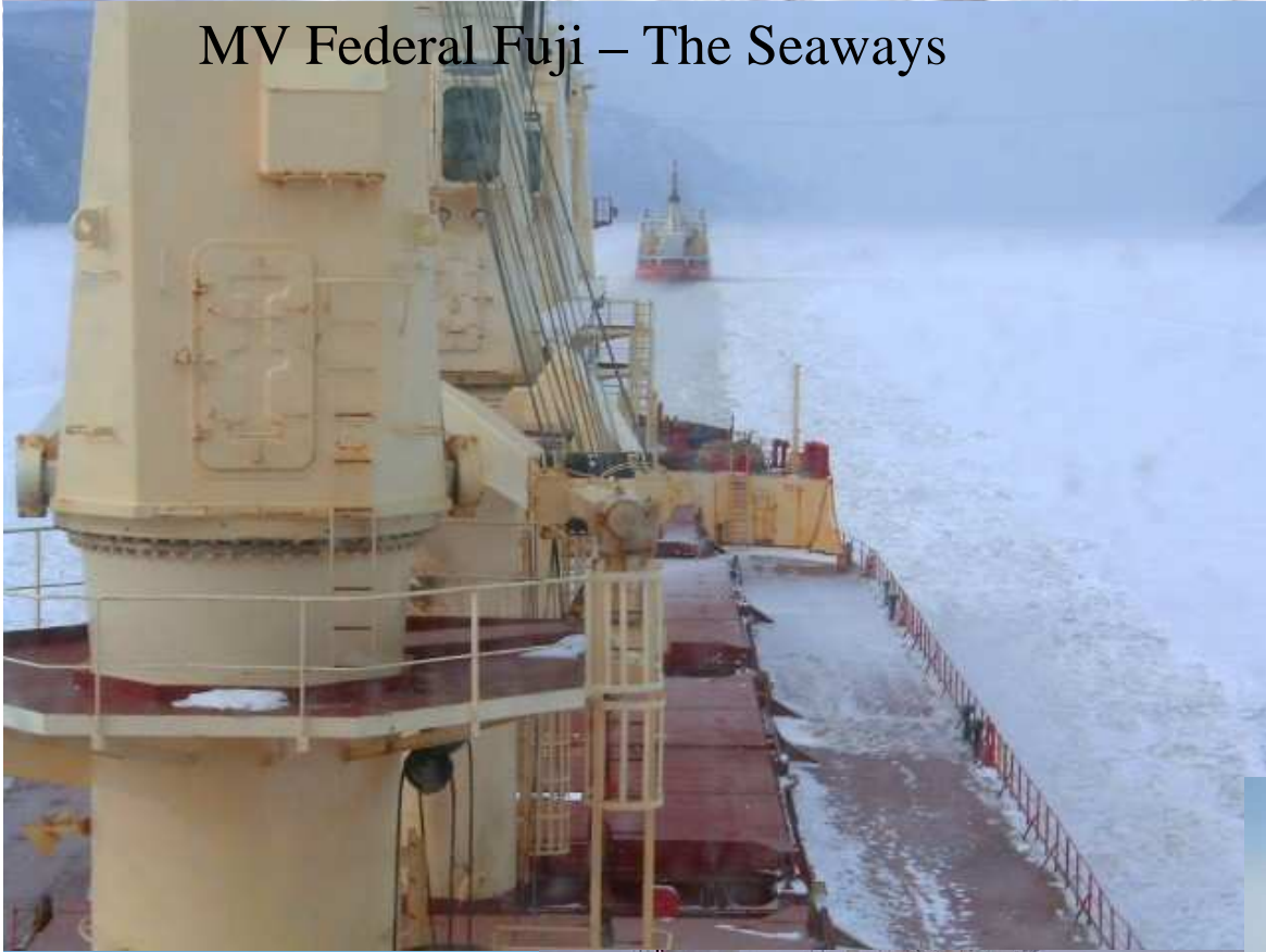
MV Federal Fuji – The Seaways